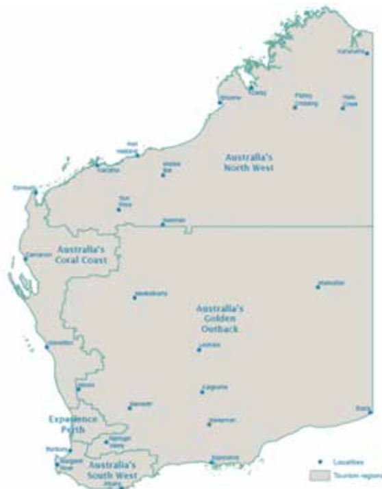
Table 3: Western Australian tourism campaign regions

We used the campaign regions because they provide a reasonable level of geographic coverage that matches data availability. Data availability and quality deteriorate with datasets that aggregate tourism activity at smaller geographic scales.